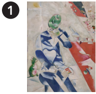
1 Artesano Gallery Main St & Green Ln Marc Chagall Half-Past Three (The Poet) , 1911