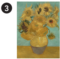
3 Canal View Park Main & Gay St Vincent van Gogh Sunflowers , 1888 or 1889