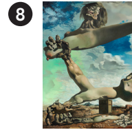
8 Salon L 4120 Main St Salvador Dalí Soft Construction with Boiled Beans (Premonition of Civil War) , 1936