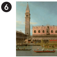
6 Richard's Apex Inc. 4202 Main St Canaletto The Bucintoro at the Molo on Ascension Day , about 1745