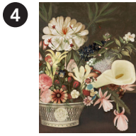
4 Chabaa Thai 4343 Main St Rubens Peale From Nature in the Garden , 1856