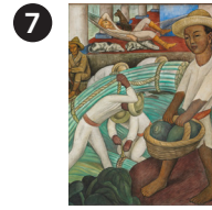
7 Manayunk Canal Towpath Entrance at Lock St Diego Rivera Sugar Cane , 1931