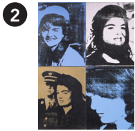
2 Main St Music 4444 Main St Andy Warhol Jackie (Four Jackies) (Portraits of Mrs. Jacqueline Kennedy) , 1964